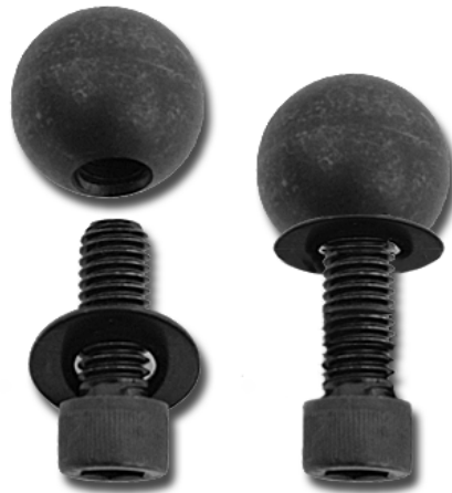
Bolts and washers are sold separately according to length specifications.

Other finishes are only available upon request